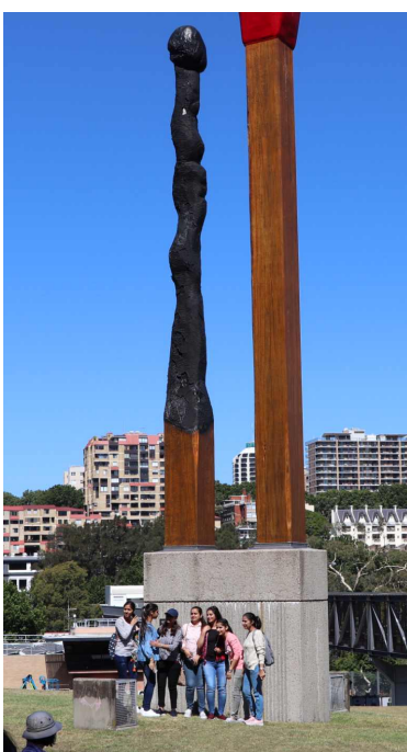
On an excursion to the Art Gallery and Domain