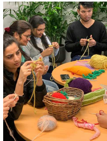
Projects and activities