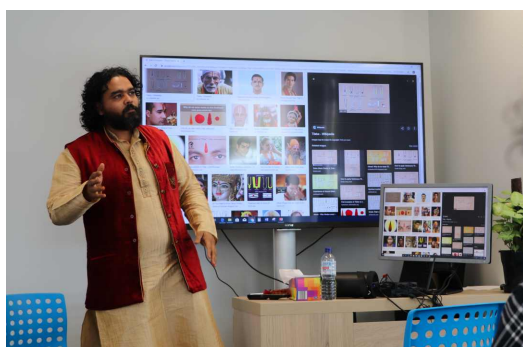
Discussing world religions and cultures