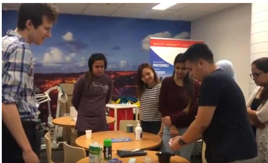
Learning how to take glucose measurements (practical activity)