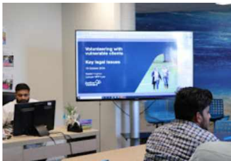
Learning about industry trends and challenges in healthcare